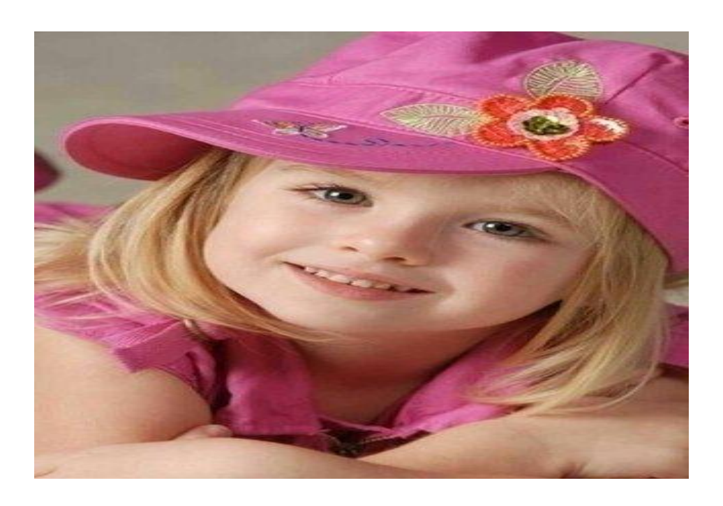
Thanks 4 U