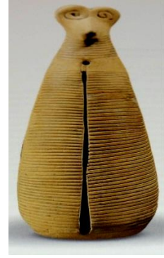
١٢٠٠ - ١٥٠٠ لورستان