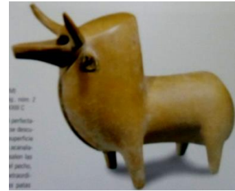
١١٠٠ - ١٢٠٠ مارليك تبة