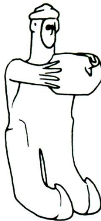
163 Vase shaped like a man offering a libation, 8th–7th c., Luristan, Archaeol. Mus., Teheran