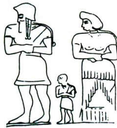
84 Rock-face relief of Hanni, Elamite king of Aiapir, in Izeh (Malamir), Bakhtiari Mountains, mid-7th c. B.C.