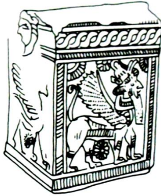
Neo-Elamite pyxis (see No. 165)