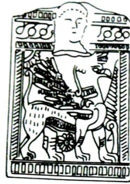
Neo-Elamite pyxis, H. 17 cm., 7th c. B.C., Susa, Louvre