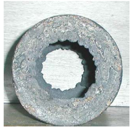
Mild Steel Casting