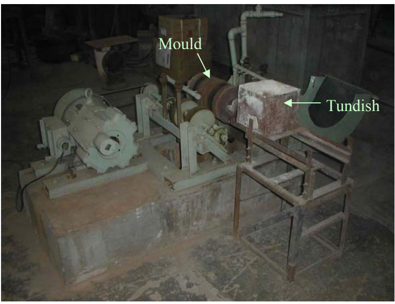
Centrifugal Casting Set Up (front side view)

Bimetallic pipes can be produced by centrifugal casting by using a cheaper material in place of a highly alloyed material. This will reduce cost of the bimetallic casting. Initially outer metal is poured in the rotating mould (mould is coated with a refractory coating) followed by pouring of second material with some time gap. When the freezing is complete the tube has an annular weld or diffusion zone. The second metal should be poured in the rotating mould after the first metal has lost fluidity. If second metal is poured earlier then the composition and thickness of second metal will be changed. Also if second metal is poured late than the first metal then there won't be good bonding.