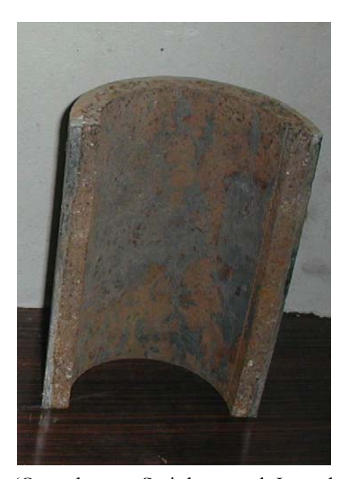
Bimetallic Pipe (Outer layer – Stainless steel, Inner layer – mild steel)