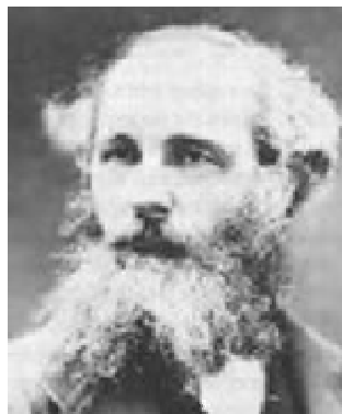
Figure 7.2: James Clerk Maxwell

These equations show that one can have electromagnetic waves in a vacuum which travel with a speed c = 3 \times 10^8 m/s, thus light is a form of electromagnetic radiation.