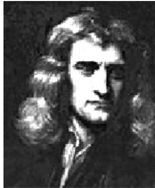
Figure 7.1: I do not know what I may appear to the world; but to myself I seem to have been only like a boy playing on the sea-shore, and diverting myself in now and then finding a smoother pebble or a prettier shell than ordinary, whilst the great ocean of truth lay all undiscovered before me. Isaac Newton.

If the particle has a velocity ( \mathbf{u} ) with components (u_1, u_2, u_3) in O , its velocity in O' is: